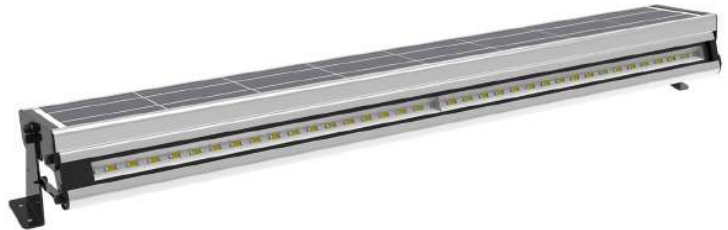
25 Watt Solar Sign Light