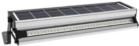
15 Watt Solar Sign Light