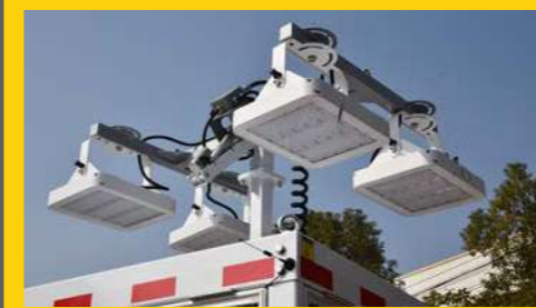
LED Lights (CCTV option)